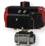
Model SN mounted to an actuator