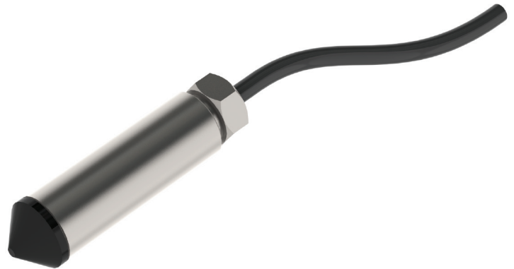
LEV1 Level Sensor

McCrometer CONNECT offers two level sensors, the LEVEL-WATCH and the LEV1. Both sensors are suitable for a wide range of applications. These highly accurate sensors are ideal for measuring the water level of streams, rivers, reservoirs, irrigation ditches, wells and tanks. Each McCrometer CONNECT level sensor is available for different measuring ranges. Please consult Selection area on the back of the page for ordering details.